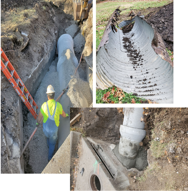
2020 Stormwater Maintenance Program