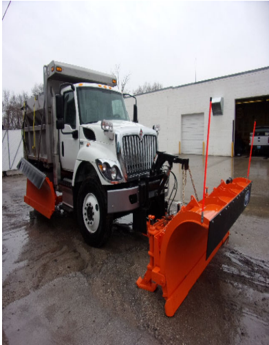
Single Axle Dump Truck