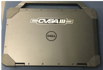
CVSA Laptop Computer